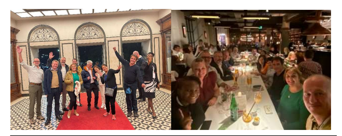
A nice time at the Commission 2 dinner.