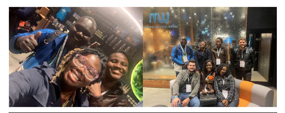
We visited the Polish Vodka Museum in Warsaw which is dedicated to the rich history and cultural significance of vodka in Poland.