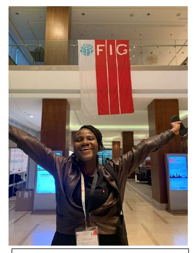
Arrived Warsaw with so much Joy and Gratitude to the FIG Foundation for the invaluable opportunity to explore.