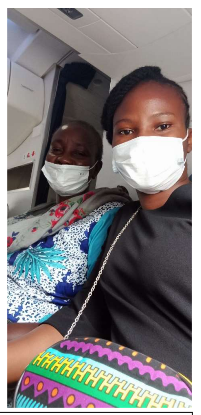
On flight from Asaba to Lagos. My mum seeing me off to catch my flight to Poland in Lagos.