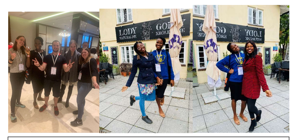
Meeting Surveyors from diverse backgrounds