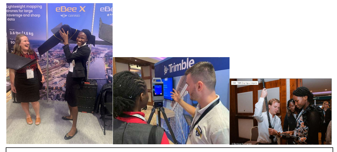
During the exhibition, I discovered many instruments I didn't know existed. What intrigued me the most was how they simplified the surveying process.

The technical sessions were inspiring, packed with valuable information. After one of the sessions, I reached out to my mentor, expressing my feelings of inadequacy upon witnessing the advanced developments in surveying from other parts of the world.