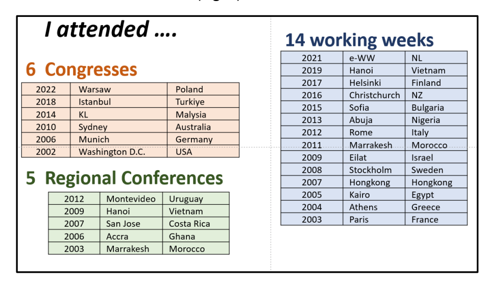
Fig. 1: Official FIG-events since 2002 attended by Rudolf Staiger

Since 2005 I attended all official FIG events (Fig. 1).