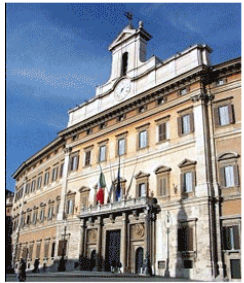
Rome: Palazzo Montecitorio

The magnificent Palaces of the Republic that were once the residences of Popes and kings: