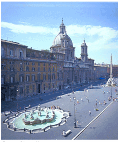
Rome: Piazza Navona