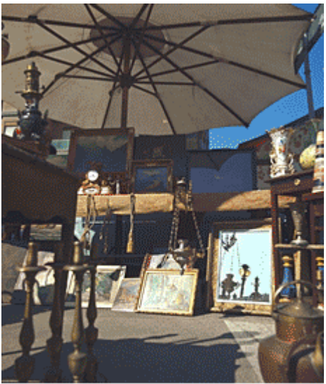
Rome: Porta Portese

Let's take а look at food and wine vou can buv. Every morning in the picturesque market in Campo de' Fiori, fruit and vegetable stalls show off their seasonal wares: the effect you get is an explosion of color and aromas that makes your mouth water. The bakers' shops and food shops surrounding the square are also culprits in stirring up this desire for food. For good wine lovers, many wine cellars in the city organize wine tasting courses and informationgiving meetings about vineyards, harvesting, fermentation and all the processes linked to the production of this nectar of the gods. Among some of the places in the city that organize such events. we can name "La Tradizione" and "Franchi". The historical coffee shops in the city are our last stop in this section, where it is possible to try typical Roman food in unique surroundings that combine culture, history and tradition. Meeting places and places to swap ideas for artists and writers in the 19th and 20th centuries such as Caffè Greco, Babington's Tearooms, Caffè Rosati and Caffè Canova. For espresso coffee-lovers, we recommend Caffè Sant'Eustachio located in the square with the same name, a fine coffee shop founded in the 1930s where the coffee is roasted by hand over wood fires.