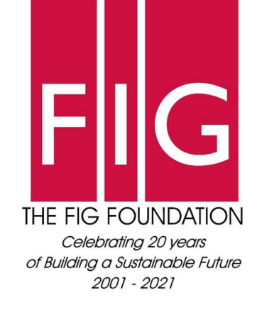
FIG Foundation and FIG Commissions