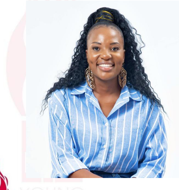
FIG YSN Officers