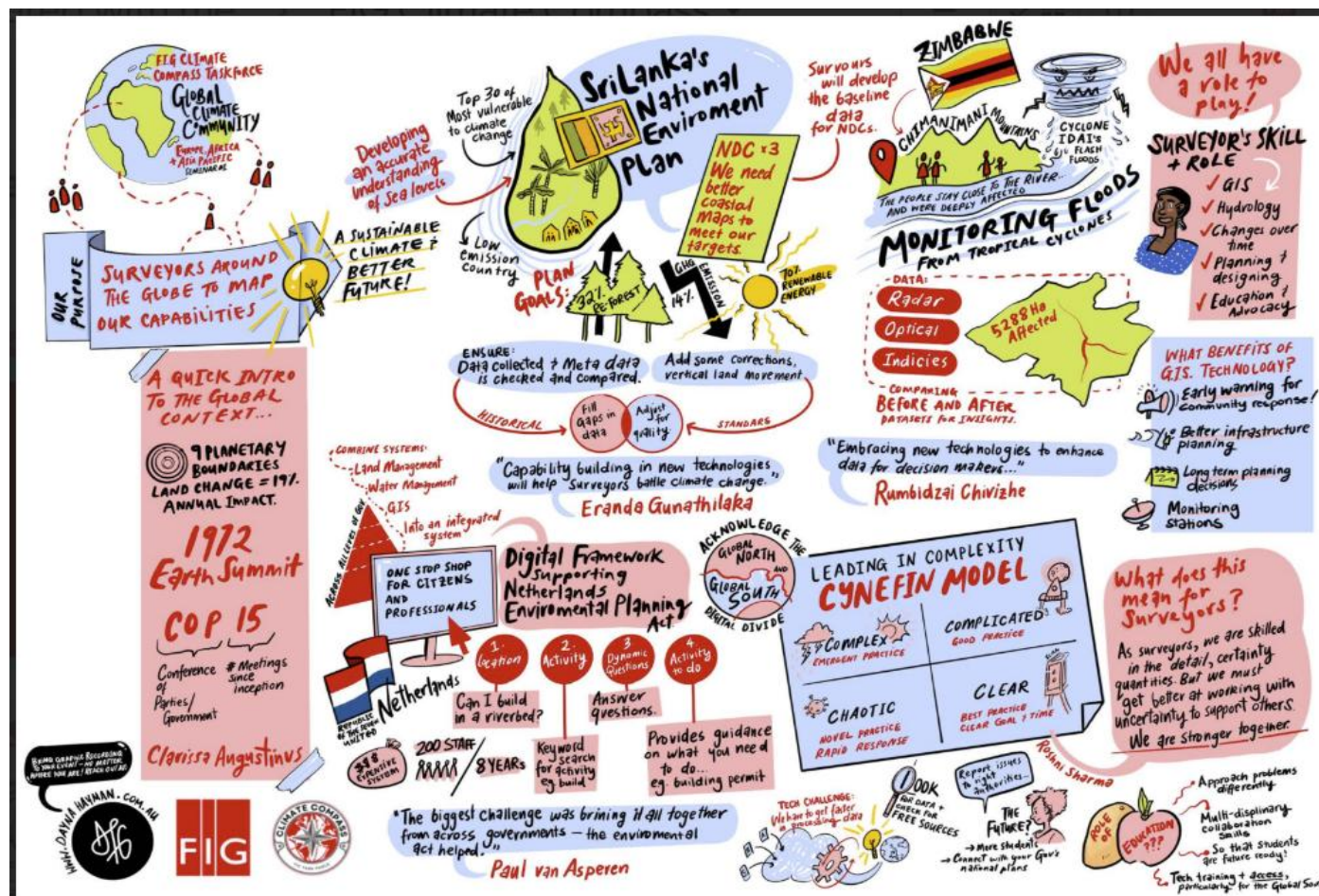
Livescribe of Seminar 1. (Dayna Hayman).