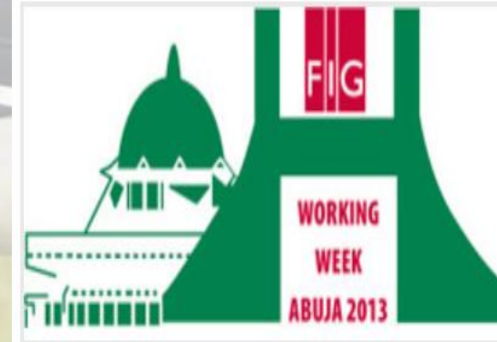
FIG WW 2013 – ABUJA NIGERIA