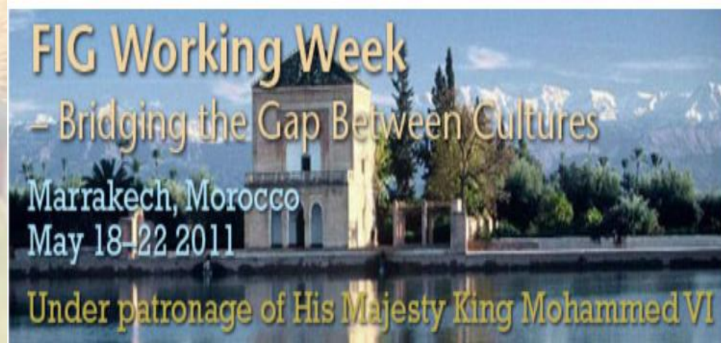
FIG WW 2011 – MARRAKECH MOROCCO