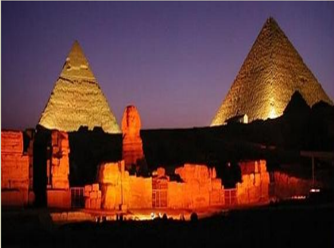
FIG WW 2005 – CAIRO EGYPT