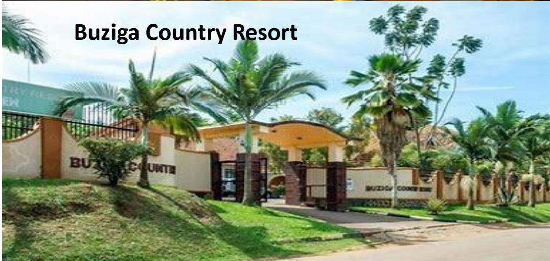
Buziga Country Resort