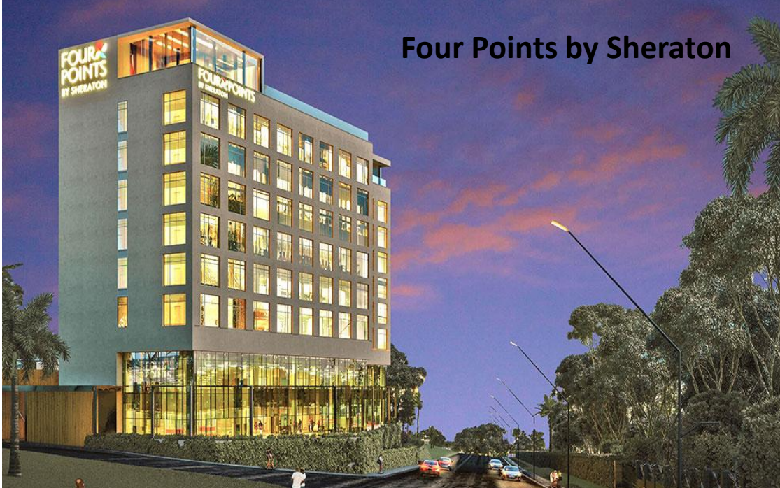
Four Points by Sheraton