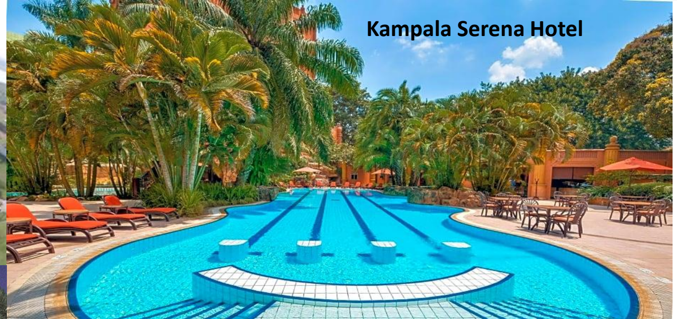
Kampala Serena Hotel