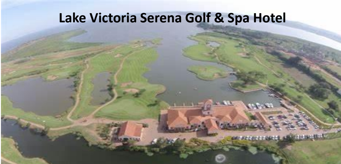
Lake Victoria Serena Golf & Spa Hotel