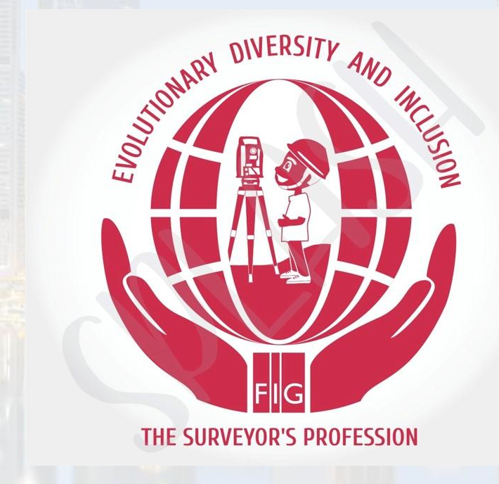
FIG Diversity and Inclusion Task Force- Sessions Report