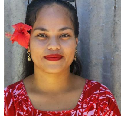
Baintaake Babera Kiribati