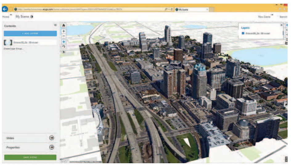
Bentley 3D models can use geospatial data such as ArcGIS from Esri

collaboration among vendors that provide the technology, much like Bentley's applications that interoperate with other vendors, such as Esri's ArcGIS, and offer i-models for the exchange of data throughout the BIM process.