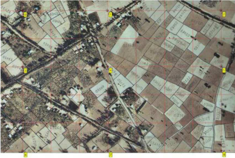
▲ Figure 2: Results of boundary drawing on top of an image. Case Ethiopia.

governance as reforms are implemented. In addition, the UN-Habitat's Continuum of Land Rights is now a widely accepted philosophy. This breakthrough in the perspective of land rights is implemented in current land tools, as well as in those under development by the Global Land Tool Network (GLTN). There is now clear interest among the key global stakeholders to solve the land problem within our generation. Implementation of the VGGTs and the Continuum of Land Rights is the driving force behind the new era of land administration.