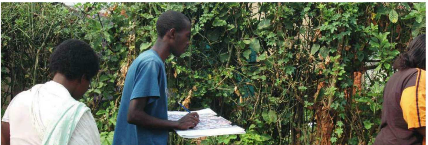
▲ Figure 1: Collecting evidence in the field using imagery. Case Rwanda.

is fully agreed at these levels. UN FAO has initiated and developed the 'Voluntary Guidelines on the Responsible Governance of Tenure of Land, Fisheries and Forests in the Context of National Food Security' (VGGTs). This comprehensive guide recommends that, where possible, states should ensure that the publicly held tenure rights are recorded together with tenure rights of indigenous peoples and the rights of the private sector in a single, or at least linked, land record system. Meanwhile, the World Bank has started assessment of good practices in the land sector through the Land Governance Assessment Framework (LGAF). The LGAF also provides tools for monitoring land