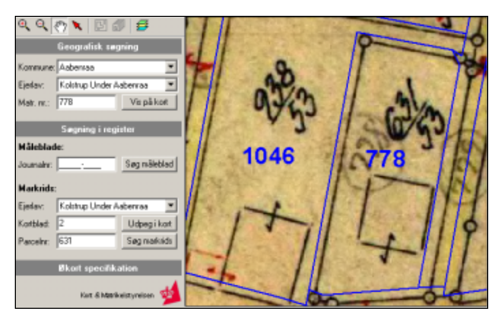
Figure 3: Cadastral map (vector) on top of scanned cadastral map.

In figure 3; the digital cadastral vector map shows the current cadastral standing, while the scanned cadastral map provides the link to the German field plans. Visually the user might identify the German cadastral number that is related to the current Danish cadastral identification. Knowing the German cadastral number the user can use the A/N interface for searching the German field plans related to the particular cadastral number.