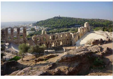
Pierrot Heritier photos