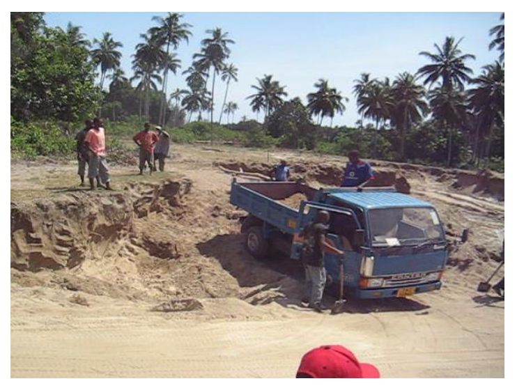
Sand mining in agricultural area

resources in Zanzibar have evidently become irreversible. The aim is to reduce land degradation through sustainable use of non-renewable natural resources. The use of alternative construction materials and the development of proper skills to improve the degraded environment are very important.