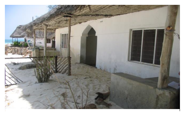
Tourism development in beach areas

Coastal resources of Zanzibar constitute a complex interconnection of a variety of ecosystems (both terrestrial and marine). There has been over utilization