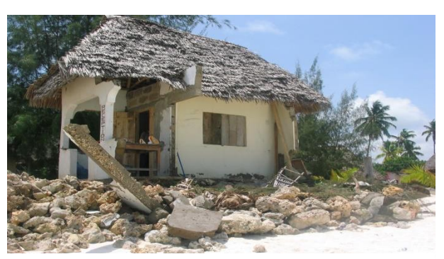
Seawater raises impact in tourism hotel development

Effects of Climate Change on Land Tenure in Zanzibar Islands (Tanzania) (8455) Rashid Mohammed Azzan (Tanzania)