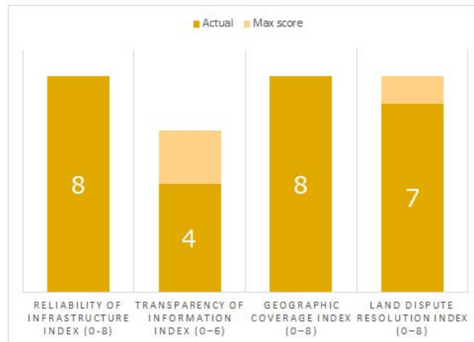
Figure 2. Sweden's ranking on Land administration in the Doing business 2016 survey