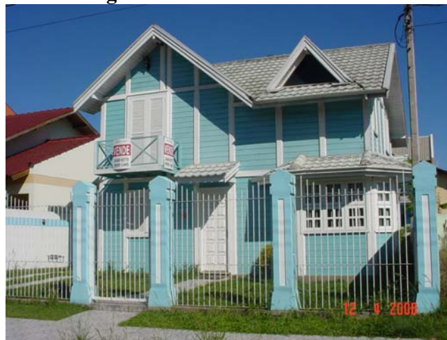
Figure 3: Construction B

In the table 02, it is possible to observe that in the cadastral data collection carried out by BIC of CIATA, both properties were registered equally. If both of them are on the same block-face, their venal value will be the same, which is in fact a fiscal inconsistency.