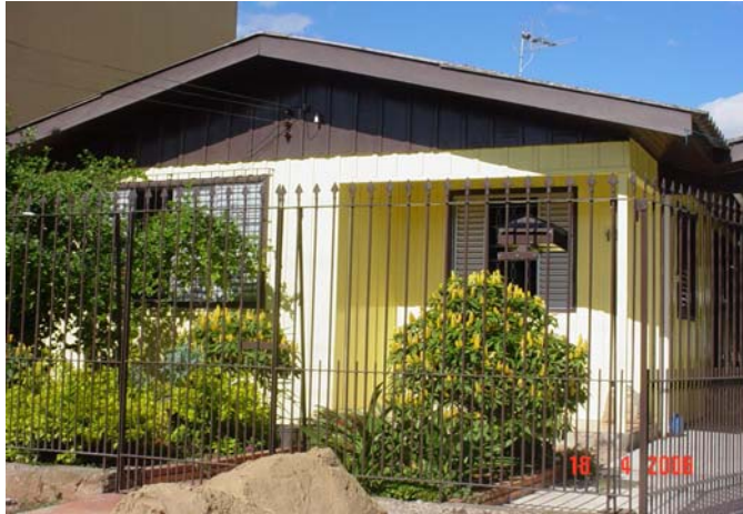
Figure 02: Construction A