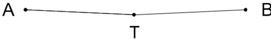
Figure 1. A tunnel surveying project

Is there an optimum accuracy for a surveying project? I will use tunnel surveying as an example for this discussion. Assume that we dig a tunnel from both ends A and B. With a traverse (or triangular network), we can meet at the middle point T as shown in Figure 1.