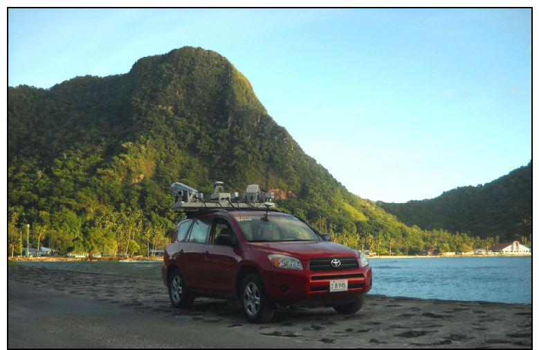
Figure 2: Lynx Mobile Mapper mounted on survey vehicle in American Samoa

A typical picture of American Samoa evokes the postcard image of a Pacific island: emerald green forested mountains, black volcanic sand beaches, coconut and palm trees, clear turquoise water, rolling surf and cloudless azure skies (Figure 2). If the Sanborn survey team was hoping for respite in a tropical paradise, they were in for a surprise.