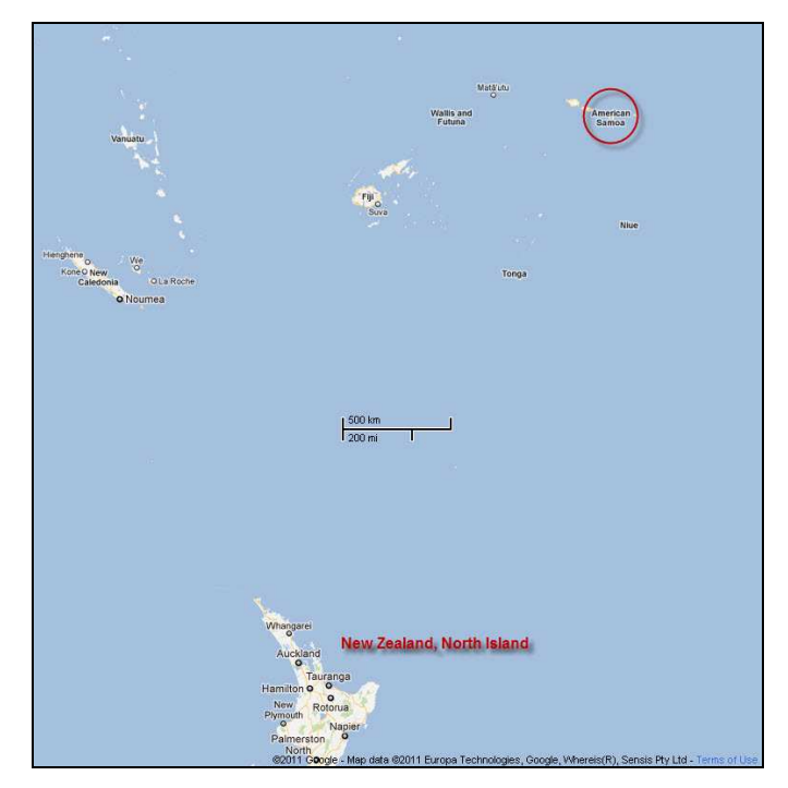
Figure 1: Google Maps image shows remote location of American Samoa (circled)

A survey team from Sanborn Map Company recently took on a project with all the expected challenges plus an unusual one: the site is located in one of the most remote areas of the world, a tiny speck of land out in the vast expanse of the South Pacific Ocean: American Samoa.