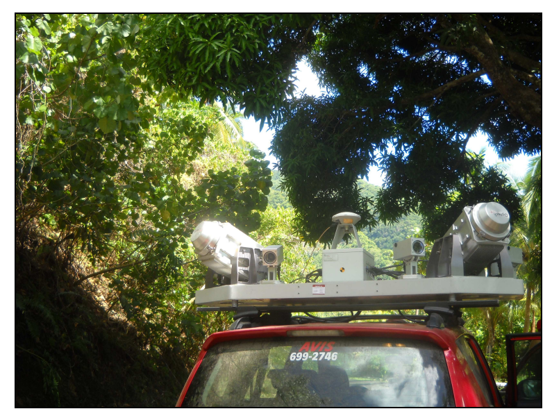
Figure 5: Optech Lynx Mobile Mapper mounted on survey vehicle surrounded by dense vegetation

pass (Figure 5). In these places crew members walked into the jungle, carrying RTK rods and collected shots out of range from the Lynx. In order to avoid any substantial gaps in the data collect, a Total Station was used to collect control and interpolation points from those areas that were inaccessible to both the survey vehicle and the surveyors on foot.