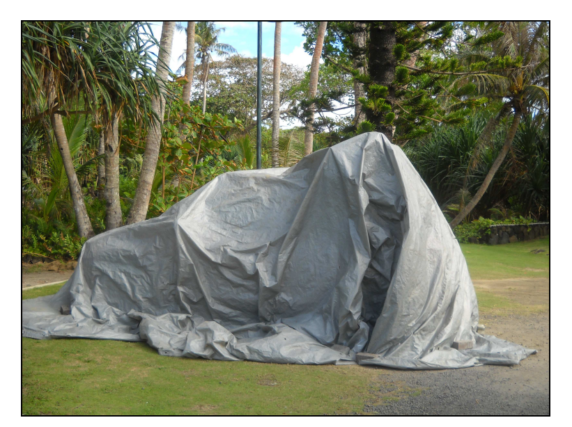
Figure 3: Lynx survey vehicle wrapped under tarp in lieu of a proper storage facility

American Samoa was hit hard by the tsunami of 2009. The National Oceanic and Atmospheric Administration (NOAA) needed data—current, accurate topographic data to assess the island's vulnerability to future storms and tsunamis. Exactly where are the lowest, most flood-prone areas? What are the elevations of the various towns clustered along the coast? Has the sea level been rising recently? If so, how much, and for how long? What is the rate of increase? Are there areas on the island that, due to their location relative to tides, currents and prevailing winds, risk greater exposure to flood waters than others?