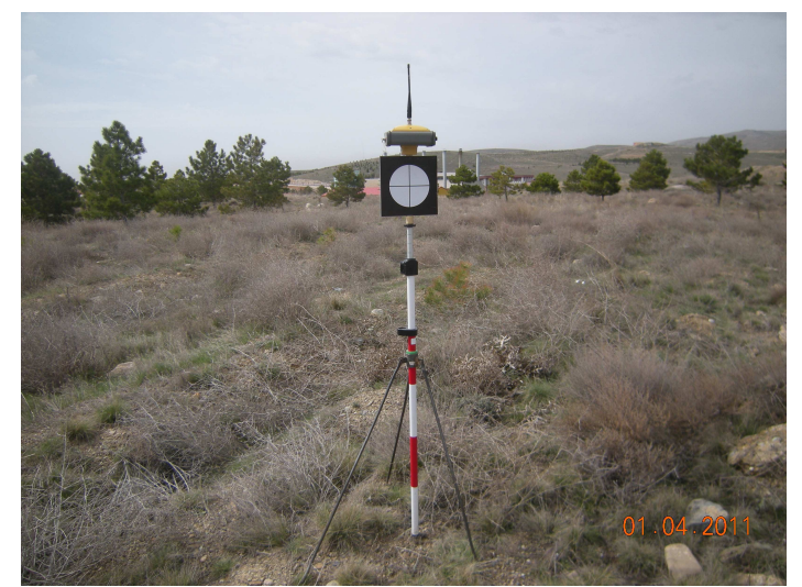
Figure 3. GPS receiver and target shape combination on scan field