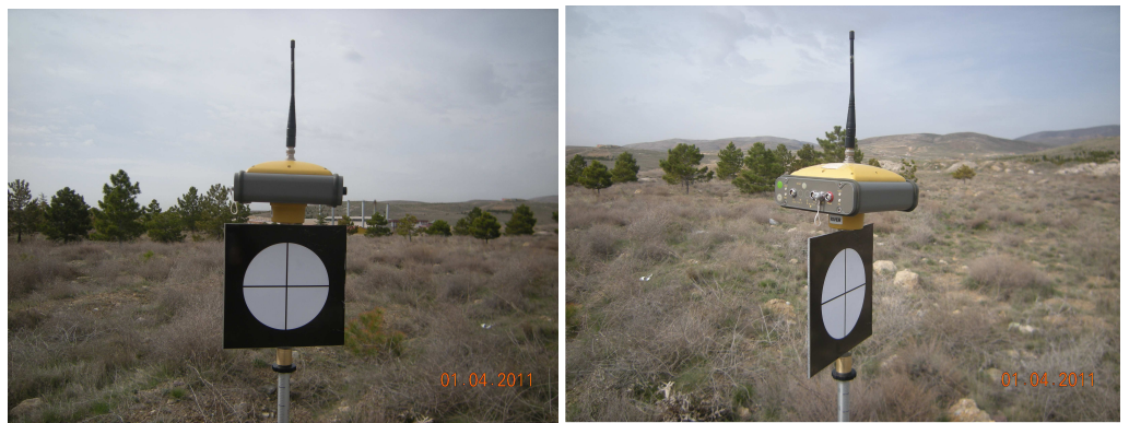
Figure 2. GPS receiver and target shape combination

TS09D - Laser Scanners III, 5859 Hakan Karabork, Cihan Altuntas, and Ekrem Tusat Combining of Scene Measurements by Laser Scanner and GPS Combination