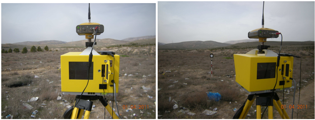
Figure 1. TLS-GPS sensor combination

Where; [X_o, Y_o, Z_o]^T and R_{\omega\phi\kappa} are translations and rotations respectively between GPS and TLS coordinate systems, and \lambda is scale. [X \ Y \ Z]^T_{GPSreceiver} is GPS coordinate of the GPS receiver on the TLS, and [t_x \ t_y \ t_z]^T is translations between TLS and GPS receiver.