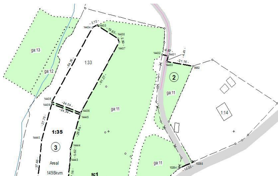
Figure 2b. Part of joint facility for ga:13, bridges and associated buoys for boats. Based on Lantmäteriet (2014, appendix KA1)