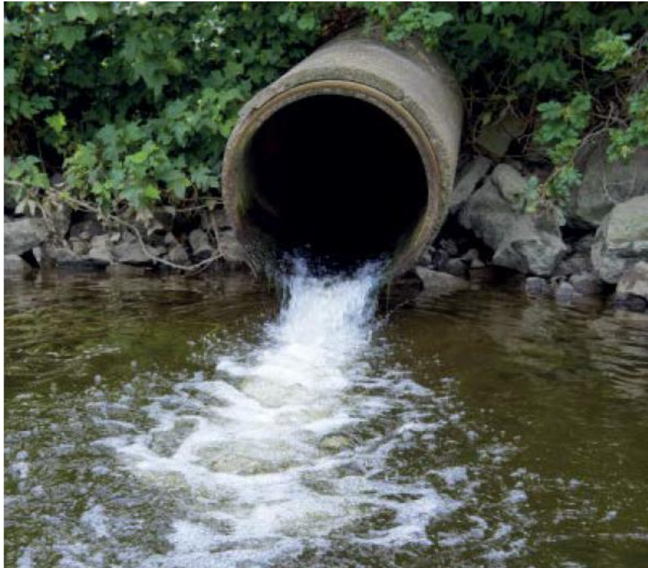
Figure 2a. Joint facility for a sewage pipeline.