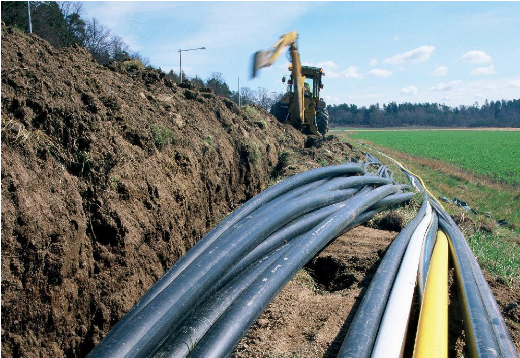
Figure 3a. Utility easement for power cables.

which regulate abolishment of easements can be done. However, even if today's legislation can be used to regulate liquidation, it does not mention anything about responsibilities for the physical liquidation of the utilities.