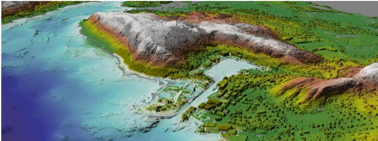
Detailed elevation data, on land and below sea, can be used to make terrain models. Illustration: The Norwegian Mapping Authority

The Ministry of Local Government and Modernisation together with seven other national government bodies, sponsor the project. The goal is to have a complete new set of national elevation and surface models at various detail levels by 2022 covering the whole country (325 000 km 2 ). All elevation datasets, both raw point clouds and derived grid products, collected in the program are open data and are freely available to everyone to use and republish (GeoForum 2019). Data from the national elevation and surface model improves the detailing of analysis for flooding and landslide, as well as overgrowth, cultural heritage sites and biodiversity.