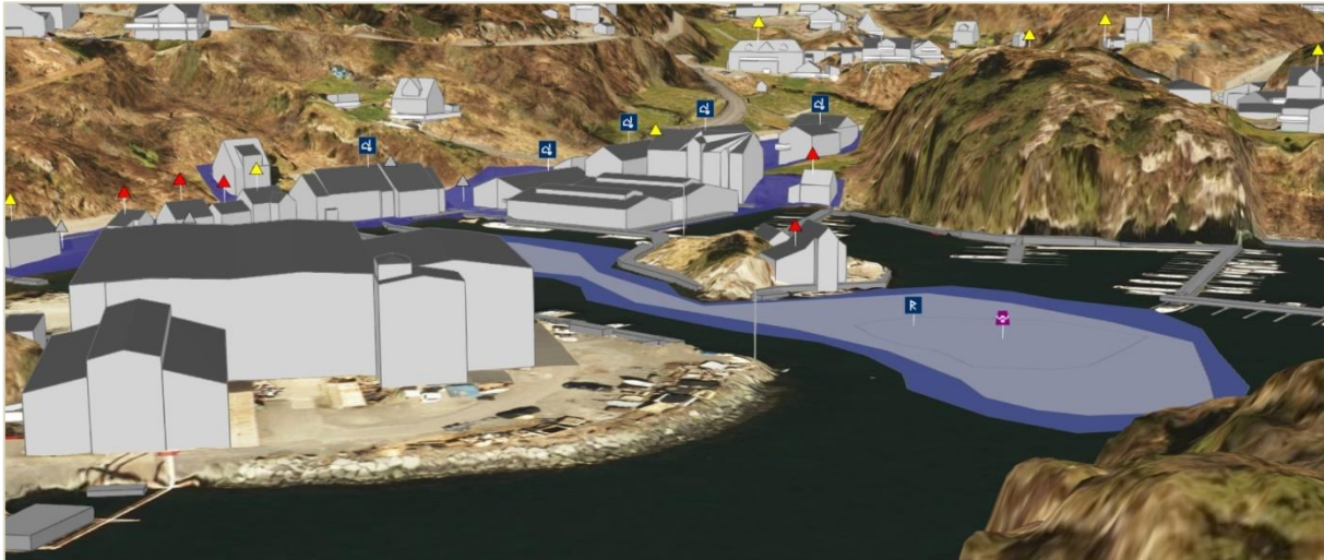
Screenshot from the municipality of Askøy shown in the guide to 3D-modelling: Veileder for strandsonen i 3D - regjeringen.no

The 3D-model is a web-solution available to everyone. Based on datasets available through the geospatial infrastructure, a 3D-image of an area can be supplied with everything from vegetation, terrain, regulations, roads, fences, traffic, cultural heritage, biodiversity, view to the sea from different angles, shadows from buildings, and more. For planners, investors, inhabitants and others, the totality at view in a 3D-model can provide a better mutual understanding of how much of the shore zone is in fact available to the public, and what consequences different forms of development will have.