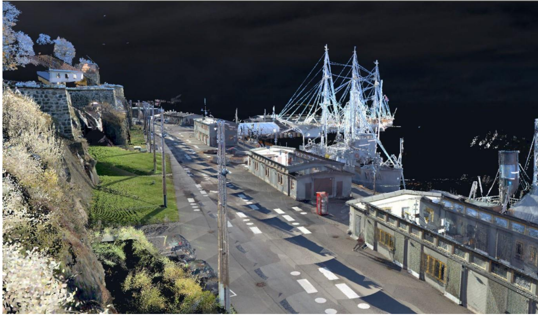
Extended mapping of the Oslo harbour.