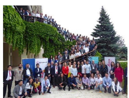
4th FIG Young Surveyors Conference Istanbul, Turkey 2018