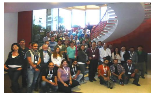
V International Training Course in Topography for Young Surveyors Lisbon, Portugal 2012