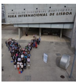
1st FIG Young Surveyors European Meeting Lisbon, Portugal 2012