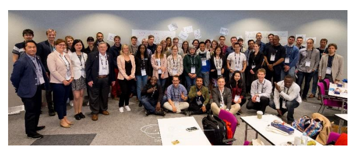
5th FIG Young Surveyors European Meeting Helsinki, Finland 2017