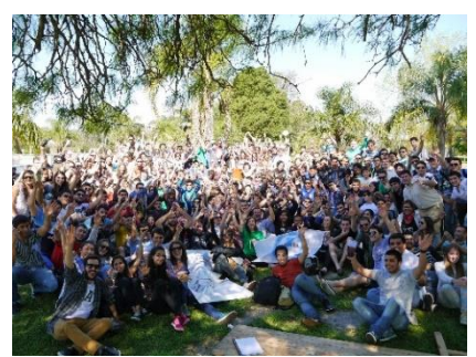
5th Young Surveyors Meeting Santa Fe, Argentina 2015