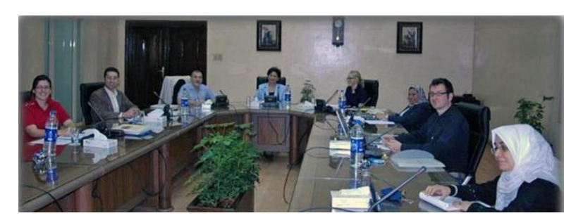
FIG Young Surveyors Board Meeting and Future of Surveying Workshop Cairo, Egypt 2007