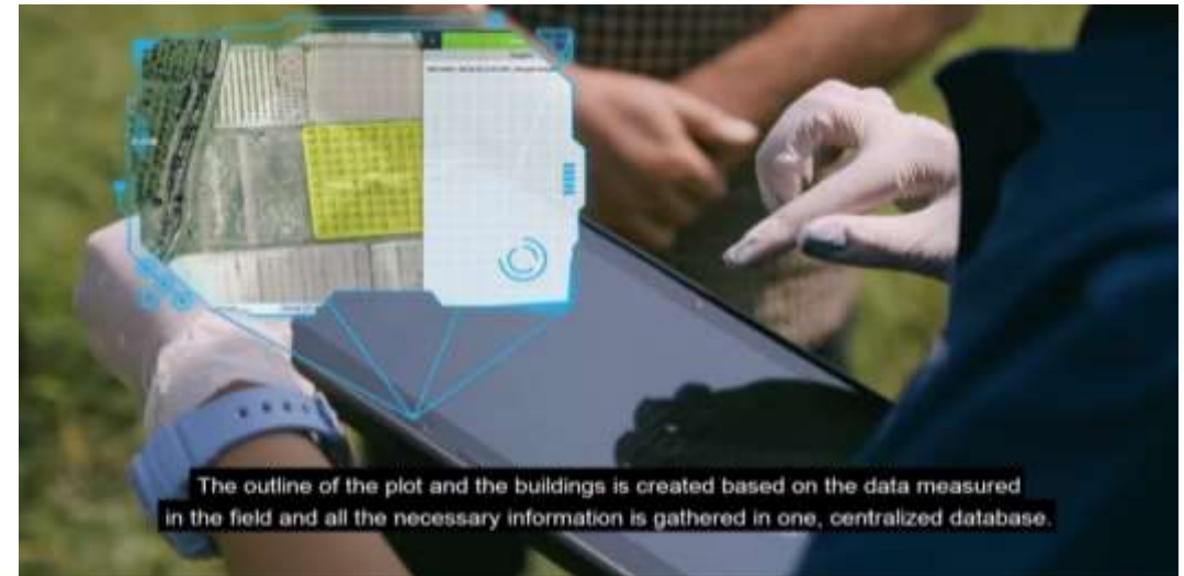
The outline of the plot and the buildings is created based on the data measured in the field and all the necessary information is gathered in one, centralized database.