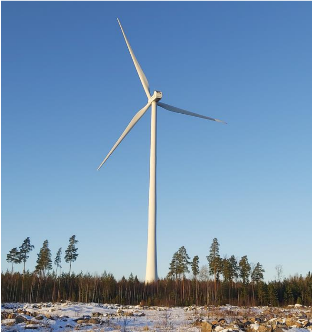
Figure 2. A windmill outside of the city of Pori.

Private landowners own over 60 % of the land area in Finland. The state of Finland owns about 30 % of the land area and the rest 10 % is owned by municipalities, churches, and companies. Most often wind power companies do not own the land under the windmills. So instead of buying the land, wind power companies lease the land from private landowners mostly through long-term contracts. Typically, this kind of leasing contracts can be valid for 30 years. For forest landowners, leasing of the land to wind power companies can be very profitable compared to what is generated from selling the wood from natural growth of the forest.