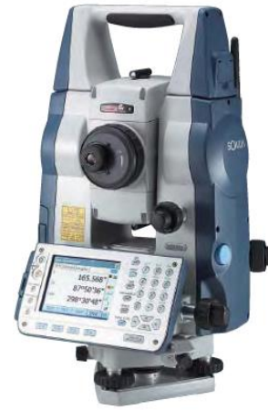
Figure 1. Measuring urban tree heights on the screen using Nemap © oblique imagery (left) and the Sokkia Set3x reflector-less total station.