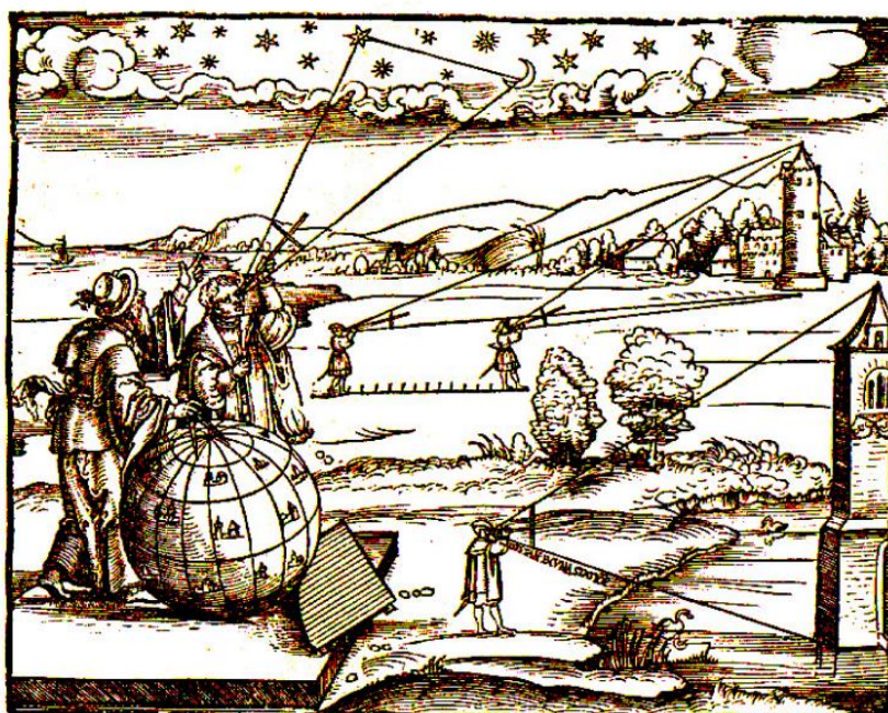
Fig. 1. Astronomical and geodetic measurements in the times of Copernicus (Beutler 2004).

Nicolaus Copernicus is best known as an astronomer – the creator of the heliocentric model of the Solar System and the author of the work De Revolutionibus , which details his vision of the Universe. On the other hand, Copernicus' activity as a surveyor and cartographer is little known, and this subject will be presented in this work. Previous research shows that Copernicus' first cartographic work was a map of Warmia and part of Royal Prussia, made around 1510. Copernicus' following cartographic work was a Livonia and Royal Ducal Prussia map. The cooperation between Copernicus and Bernard Wapowski in drawing up a map of the Kingdom of Poland and the Grand Duchy of Lithuania is worth noting. Unfortunately, none of the maps made by Copernicus has survived in the form of the original.