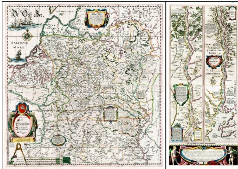
Fig. 3 Map of Lithuania by Prince Radziwiłł, edition from 1613, contains a Dnieper map (Lituania 2023).

determining the longitude is much greater than that of the latitude due to the difficulty of measuring time.