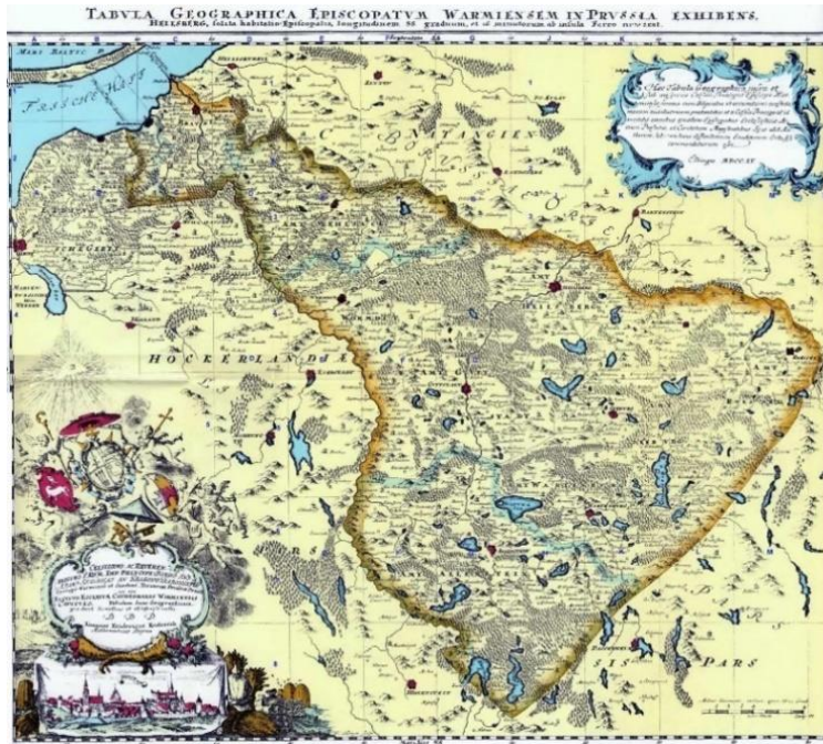
Fig. 5 Map of the Duchy of Warmia made by Jan Fryderyk Endersch (Wiki-2 2023)