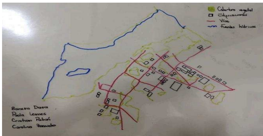
Figure 5. Cartographic Rectification: Intercultural School of Geography for Life.