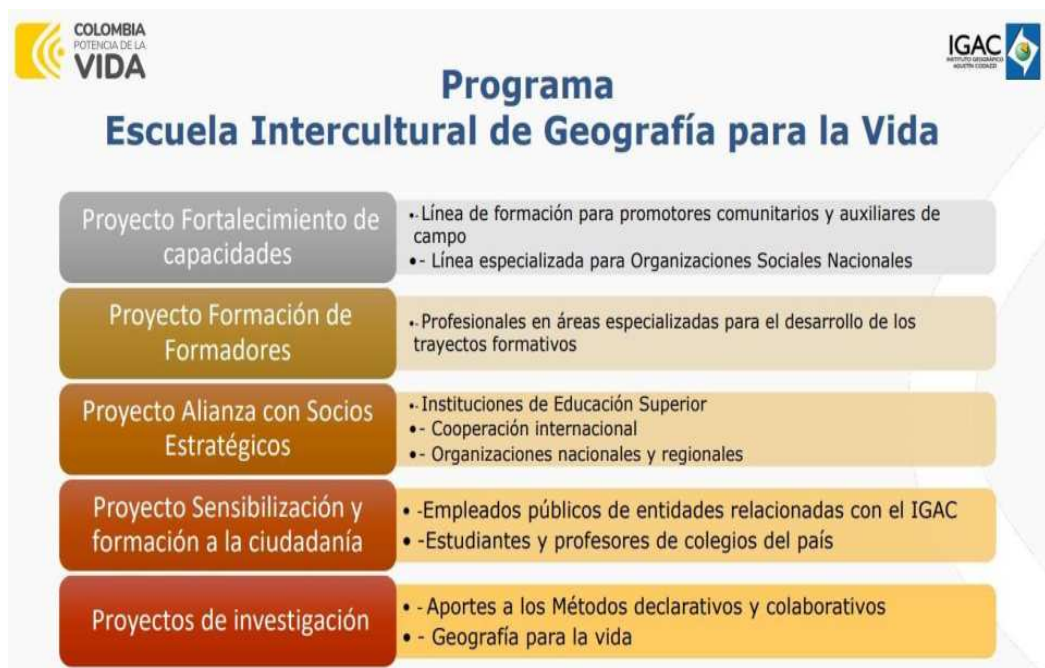
Figure 1. Program: Intercultural School (PIS) of Geography for Life.

Thus, the proposal to strengthen capacities developed from an alliance with the German Agency for International Cooperation (GIZ), to develop a training process for a rural community to be certified as Community Promoters and Field Assistants, profiles that will then be linked to the process of cadastral operation. From this pilot, the proposal for the Intercultural School of Geography for Life program was created, which in addition to the capacity building project, develops other projects (GIZ, 2024).