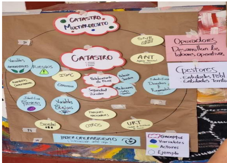
Figure 3. Lessons and Dialogues: Intercultural School of Geography for Life.

It is worth highlighting the importance of the synergy that can be produced between technical and social knowledge, according to each level and its complexities. In the specific case of this project, we co-constructed the first level, which corresponds to awareness/participation and initiation of basic training in Multipurpose Cadaster (IGAC, 2023).